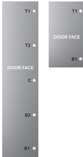
DRILLING POSITION HINGED RIGHT