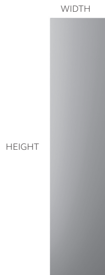
PANEL SIZE PARAMETERS: