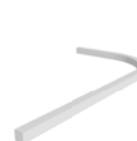
QUADRANT UNDER PLINTH 20 X 570 X 318