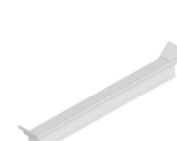
MANTLE SHELF 196 X 2500 X 202