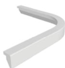
QUADRANT LIGHT PELMET 55 X 430 X 430