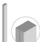
TALL FEATURE END POST 3000 X 50 X 75