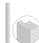
UNIVERSAL MOULDING 35 X 3050 X 60