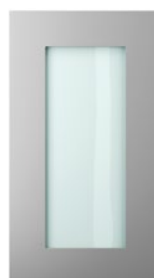
PLAIN FRAME Includes clear glass