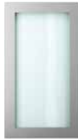
PLAIN FRAME includes clear glass