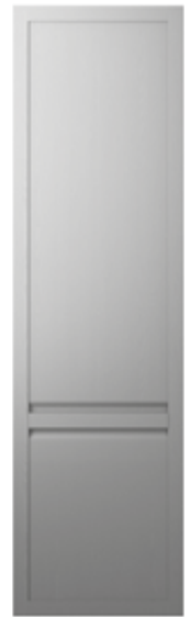
CROSS RAIL DOOR