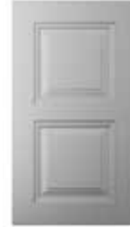
CROSS RAIL DOOR