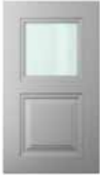
SINGLE GLAZED DOOR glass not supplied