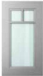
GEORGIAN FRAME glass not supplied (number of panes depends on width)