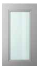
PLAIN FRAME includes clear glass