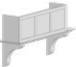
OVERMANTLE 1150 X 450 X WIDTH MIN (W): 1400 MAX (W): 1900