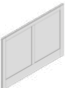
FRAMED END PANEL WITH VERTICAL DIVIDING RAIL & 150 BOTTOM RAIL (ISLAND) 870 X 901-1200 X 20