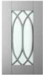
GOTHIC CARVED FRAME glass not supplied

Doors over 1464 require cross rails. Please specify 1, 2 or 3 rails when ordering. Frames exclude glass.