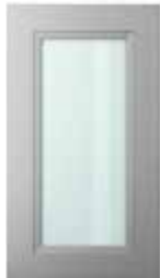
PLAIN FRAME glass not supplied