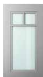
GEORGIAN FRAME includes clear glass (number of panes depends on width)