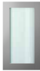
PLAIN FRAME includes clear glass