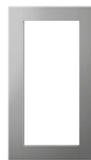
PLAIN FRAME glass not supplied Note. Frame/Frame with cross rail come part assembled & unglued. (excludes glass/mirror)