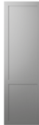
1965 DOOR with cross rail - 70/30 alignment