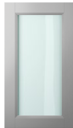
PLAIN FRAME includes clear glass