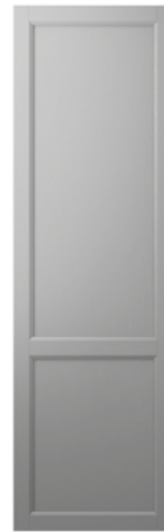
1965X597 DOOR with cross rail